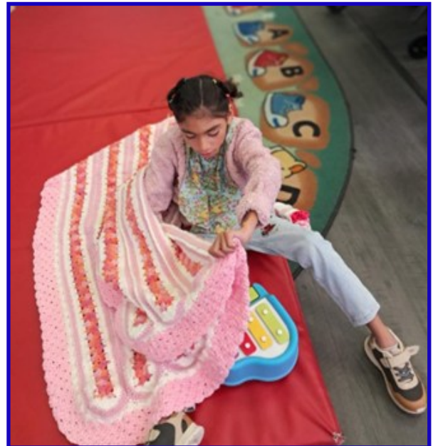
Students at Buckingham Exceptional School with their Afghans crocheted by Yvonne Murray.